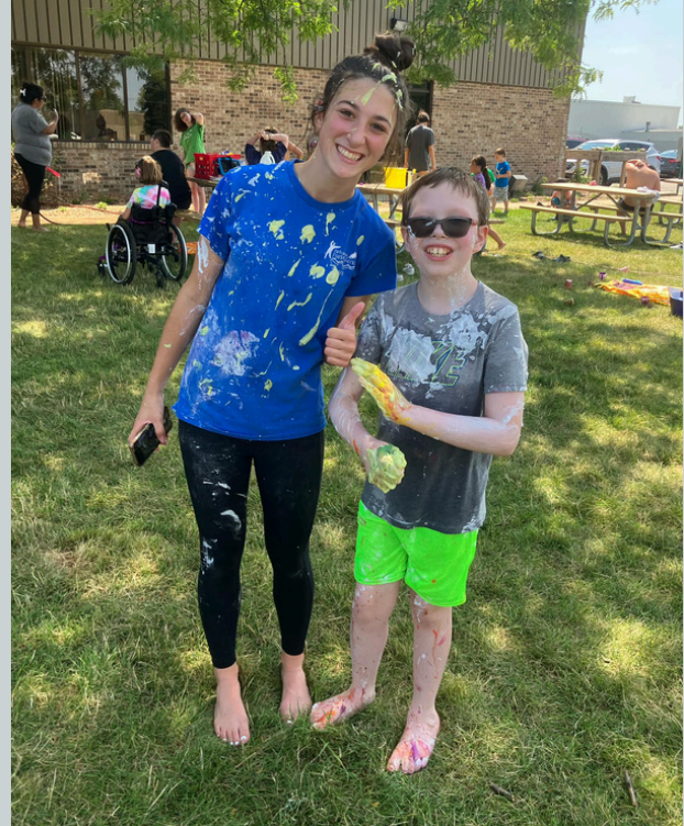
*Discount available for multiple children; including those attending 3rd Base. Early dismissals are included in the fee.

Payment Options: Payments can be made via installment billing or in person. With the installment billing option, payments are automatically withdrawn weekly from the debit/credit card on file every Thursday the week before attendance. Please note, if you have 3 card declines within the current school year, you will be taken off of installment billing.