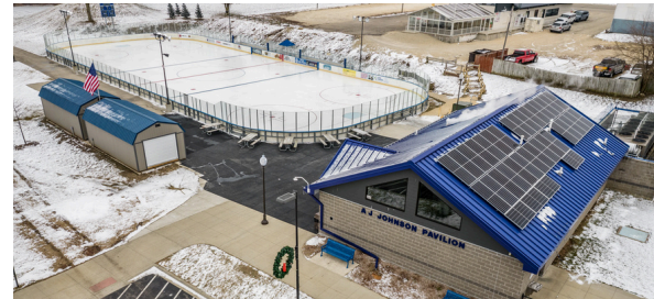
Temperature controlled cabins available for rent starting at $40/hr